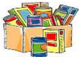
Feeding the Community

Please remember that Sunday, December 10 th is our Food Bank collection. Items needed are: juices, cereal, fruit cups and Christmas candy. Please bring your items for collection during church and help those in need in our community.